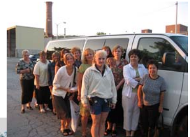
VAN PAL GALS